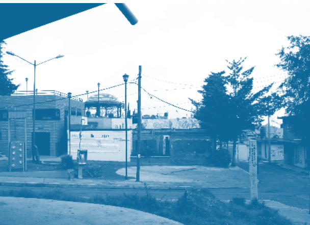
Existing dome and community complex with library, creamery and health centre, seen from dome

The Miravalle Community Council has created a robust network of local stakeholders, specialists and civil organisations. Cooperation between these groups allows for improved communication with government structures. The ambition of the council is to foster local transformation, and, in the process, become a model for socio-cultural reactivation in other marginalised urban communities.